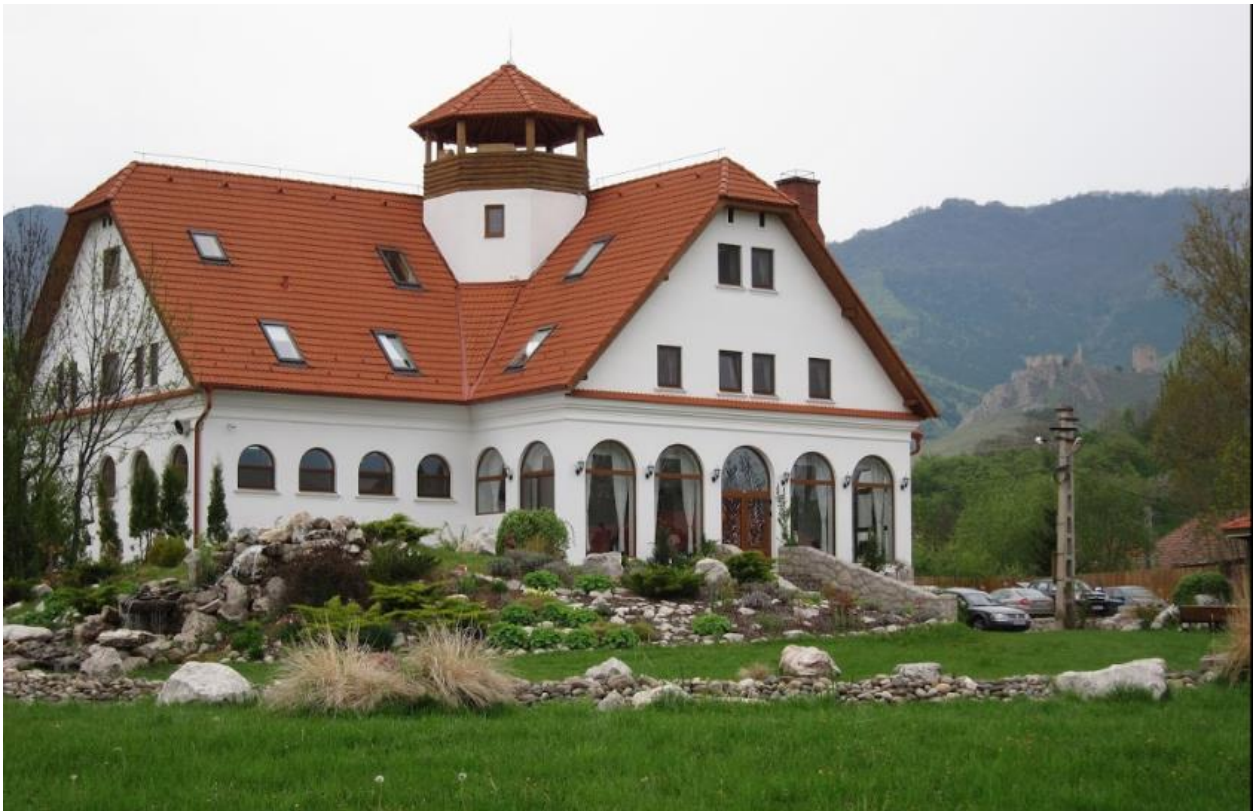
Conacul Secuiesc (Szekely Mansion)

Coltesti Village, nr.77, Alba County, ROMANIA 📞 +40-730-210-768 📠 +40-258-768-277